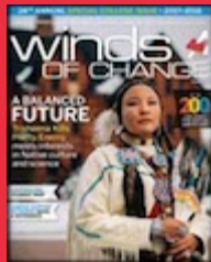
Winds of Change magazine

Submit your bold idea for the chance to receive C$5,000 in seed funding and present your innovation to North America's top environmental officials in Oklahoma City this summer.