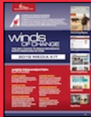
2018 Media Kit